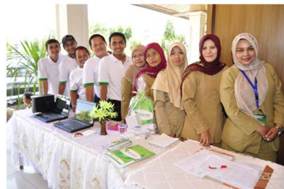
Representatives of the AcehInfo Secretariat and the UNORC team