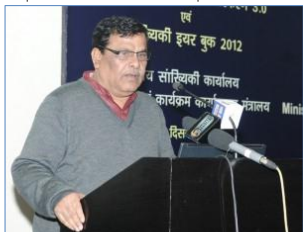
Hon. Minister of State (Independent Charge), MOSPI, Shri Srikant Kumar Jena, speaking at the launch ceremony

Speaking at the launch ceremony, Shri Srikant Kumar Jena, Honorable Minister of State (Independent Charge), MOSPI, affirmed, "Having collected the data, the Government is also duty bound to release the data in an informative mode, for use by policy makers and planners, national and international organizations, research organizations, think tanks, and the public. Today's release is yet another example of our Ministry's commitment to provide useful data to all for informed decision-making."